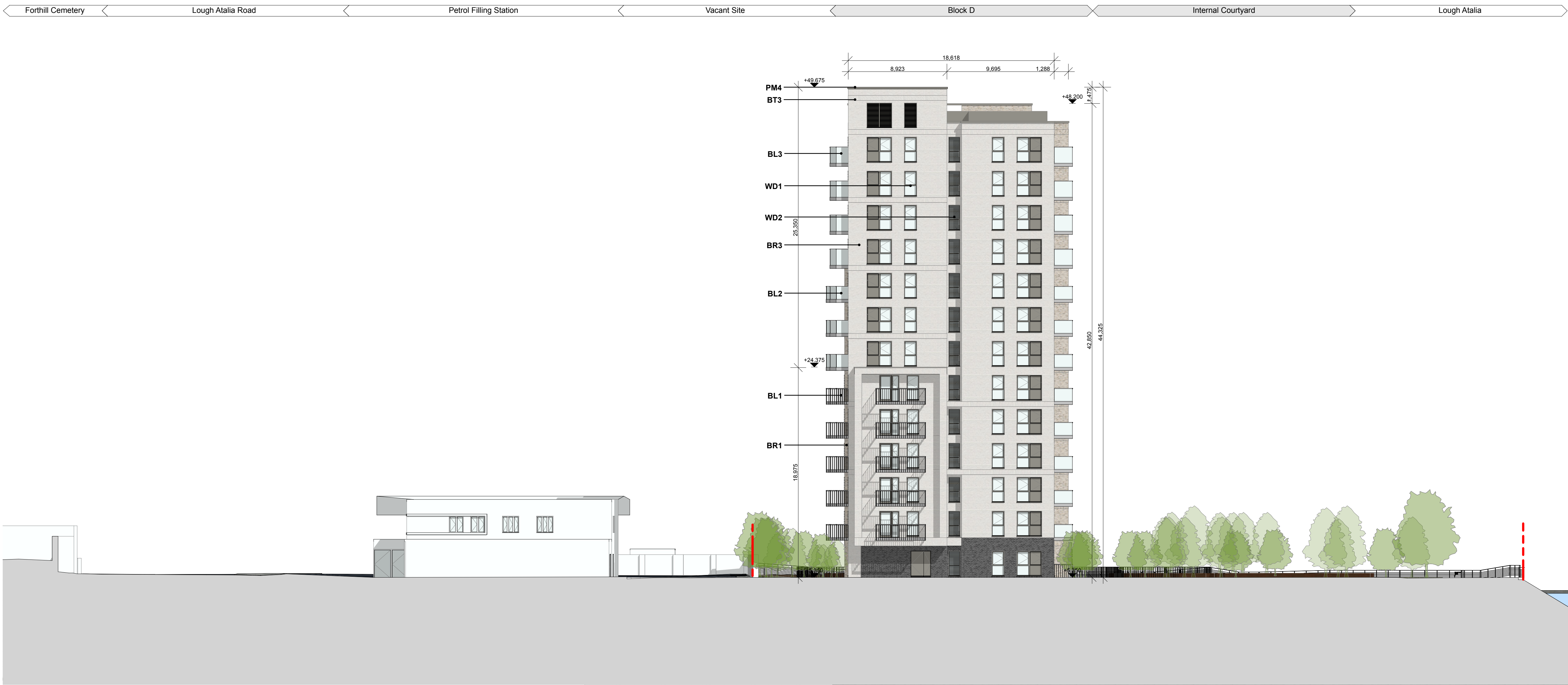
J-J Internal Courtyard Section Elevation - Block B SCALE:1:200