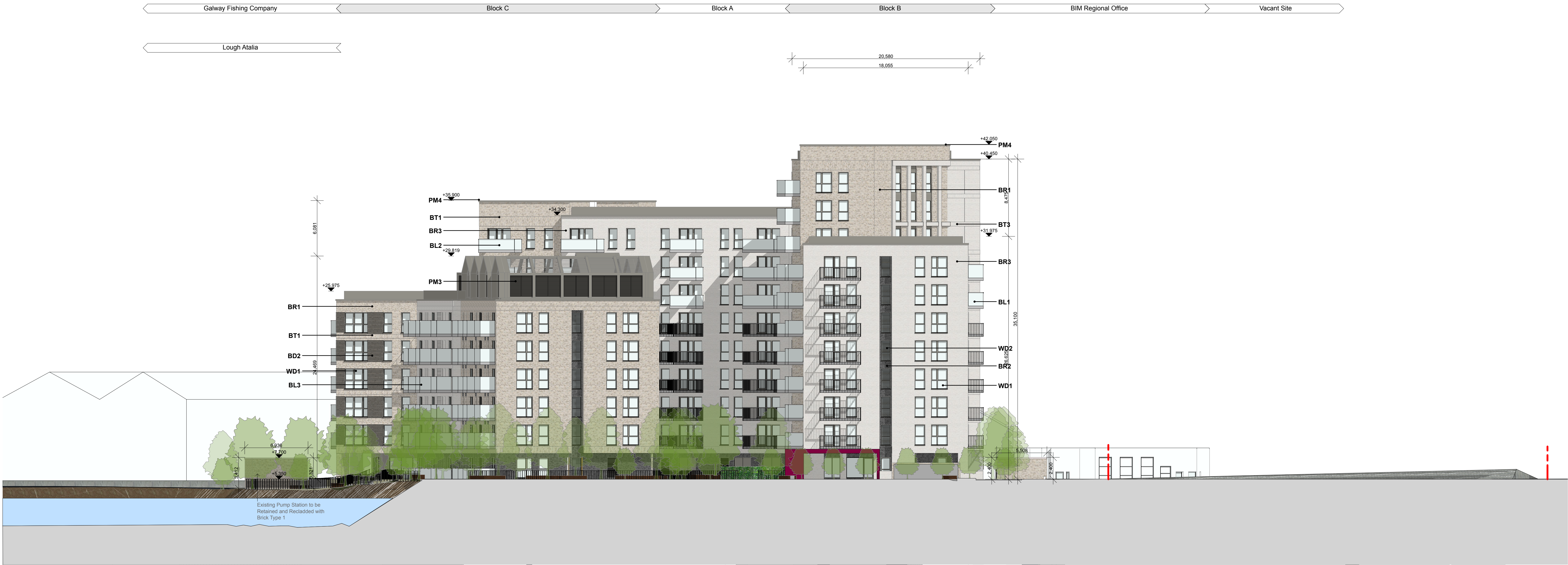
G-G Internal Courtyard Elevation - Block B & C SCALE:1:200