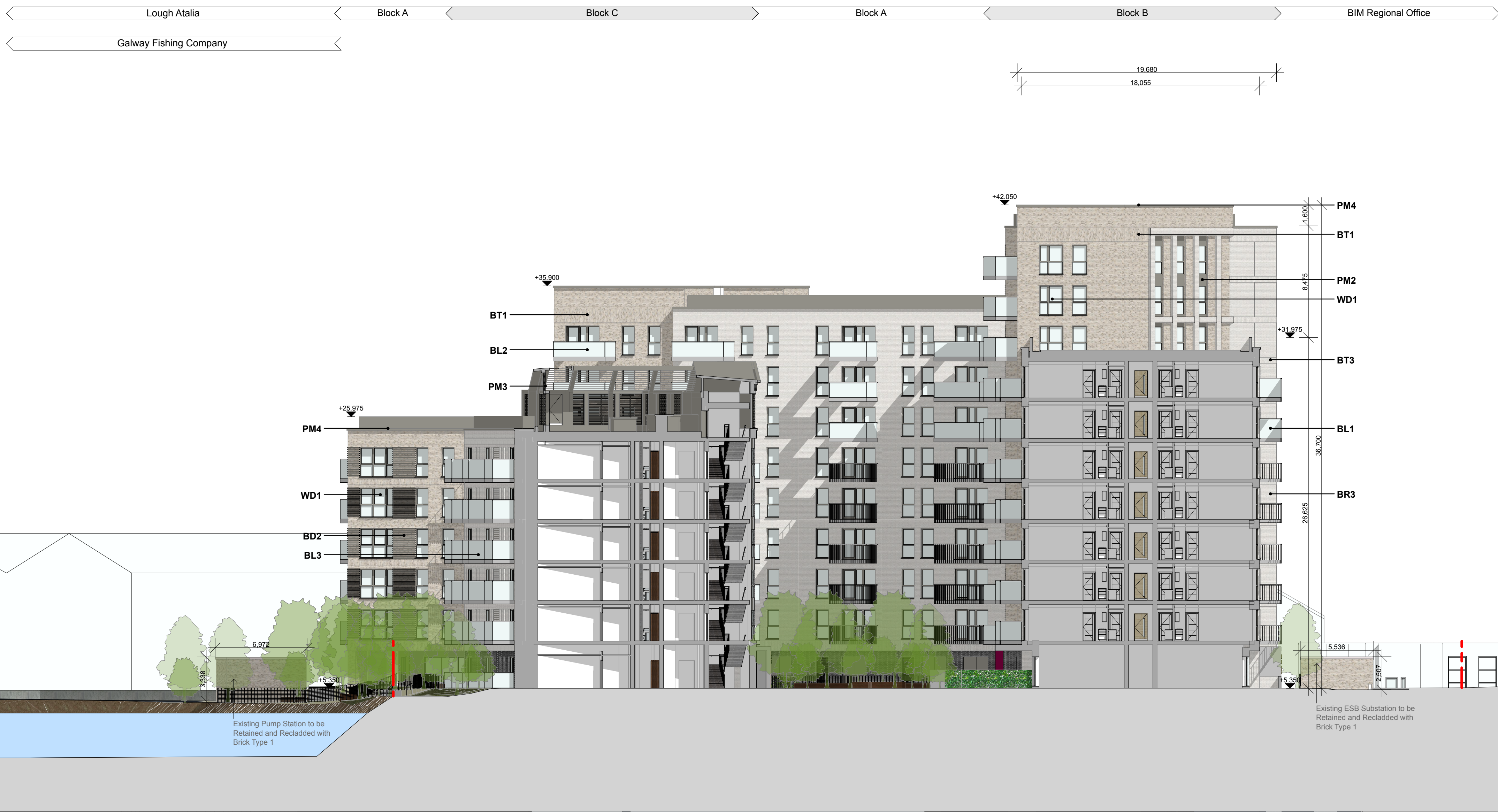
D-D Internal Courtyard Section Block B & C SCALE:1:200