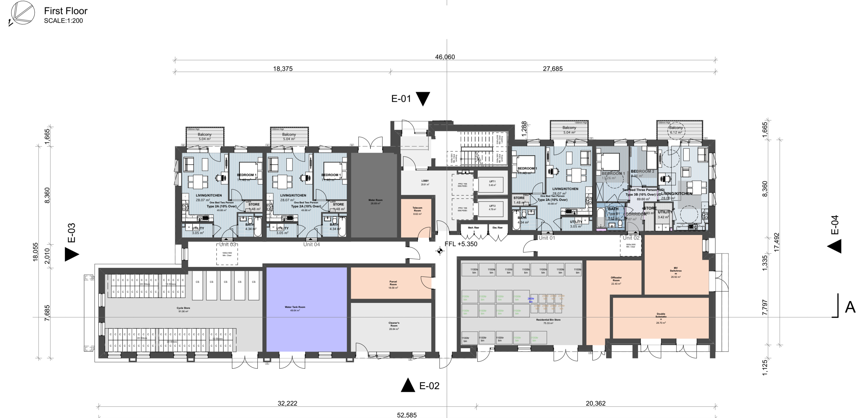
First Floor SCALE:1:200