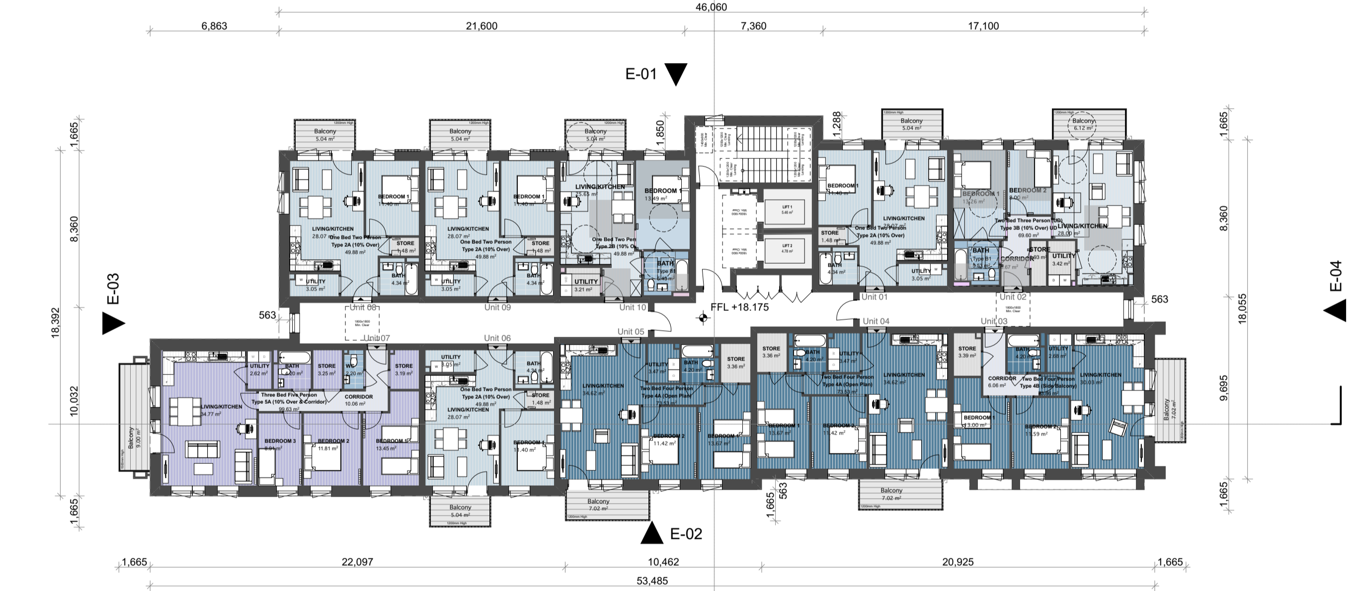
Fourth Floor SCALE:1:200